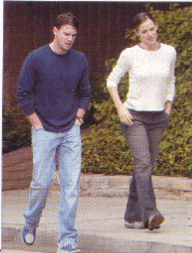
February 18, 2003: Foley and Garner head to a Hollywood shopping center.