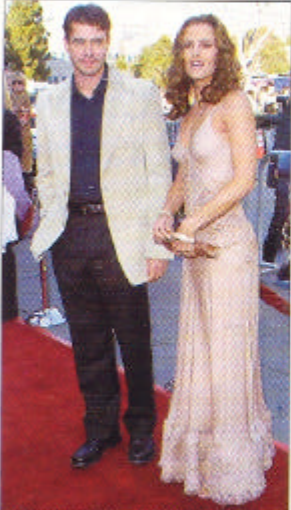
February 9, 2003: The pair at the Daredevil premiere.